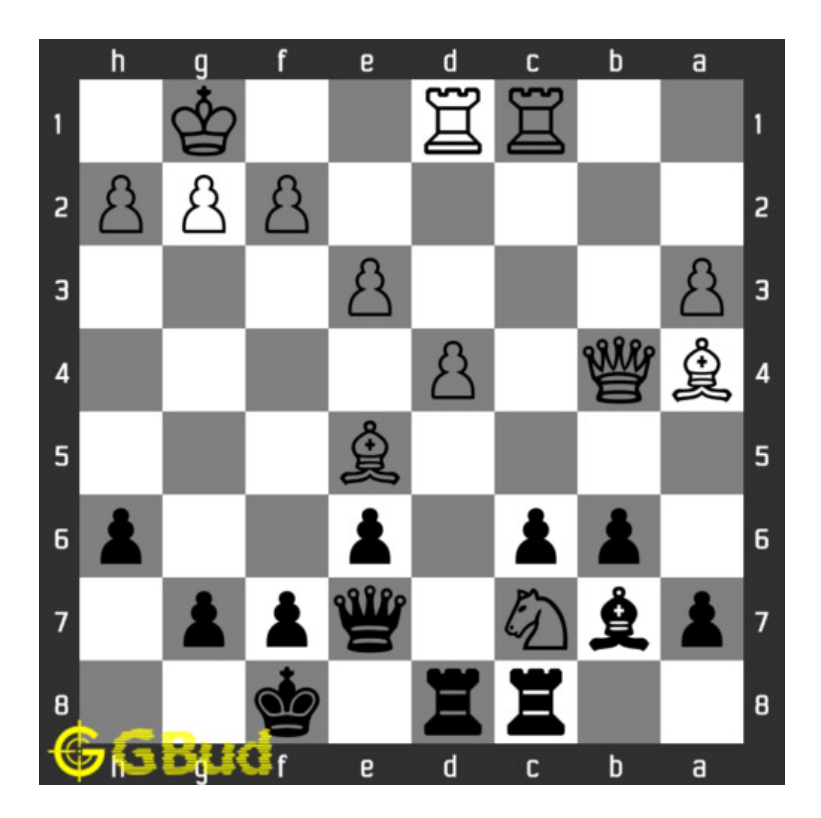
Figure 1.1: Solve this Medium chess puzzle 0008. Avoid losing the queen @ https://gbud.in/gj18p52