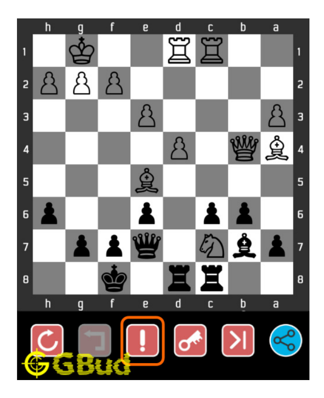
Figure 1.4: Click the help button to get help on next move @ https://gbud.in/gj18p52